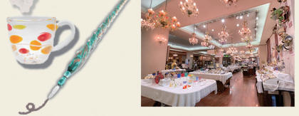
① Kitaichi Venetian Art Museum /Museum shop

"Trip to Venice in Otaru" "Museum shop" on the first floor sells directly imported Murano glass, glass pen, glass jewelry, ornament and heat-resistant glass.